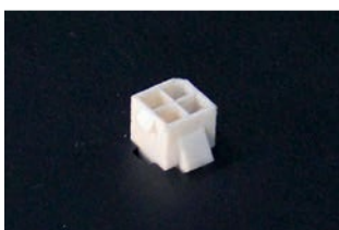
Diagnostic connector Item number OPT0270