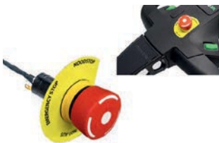
Emergency stop complete Item number OPT0063