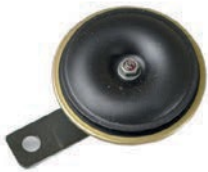
Horn 103dB Item number OPT0059