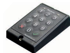
Code lock Item number OPT0068