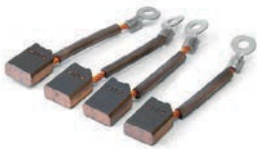
Carbon brushes (set of 4) for Motor 300W Item number M0186