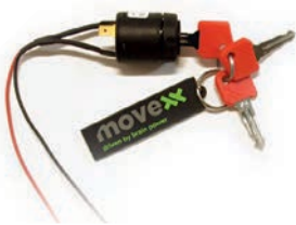
Ignition key 701 (equal) Item number OPT0146