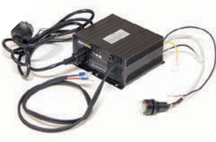
Charger (internal) AGM battery 24V / 5A + external indicator Item number M0246