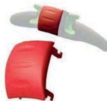
Belly button RED Item number M0121-BBUT