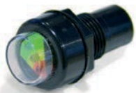
LED battery indicator (build-in) Item number M0318