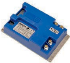
Italsea drive controller in 24V / 36 bat, in 10A / Imax 45A Item number M1122