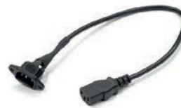
Chassis cable charger Item no M0158-Stekker