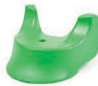
Switch buttons (2x) green Item number M0121-KNOP-GROEN