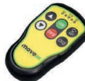
Remote control 4 channel, 2,4 GHz Item number OPT0505