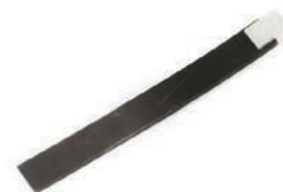
Antistatic strip Item number OPT0058