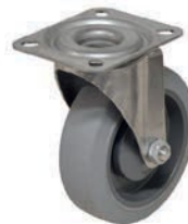
Castor wheel Gray Ø 125 mm Item number M0120