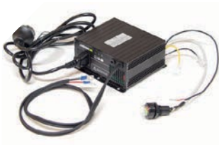
Charger (internal) AGM battery 24V / 5A + external indicator Item number M0246