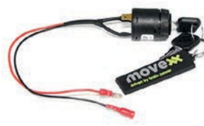
Ignition key (unequal) Item number OPT0145