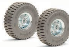
Set Drive wheels full rubber, non-marking Gray 2x Ø 250 x 80 mm Item number 335572