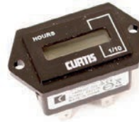
Hour tracker Item number OPT0056