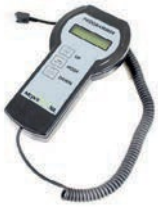
Programmer for Italsea Item number D0003