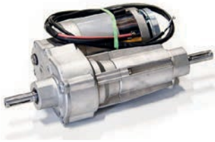
Motor 300W / 100rpm with brake Item number M1033