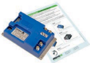
Italsea drive controller in 24V / 36 bat, in 10A / I max 45A Item number M1122-SP