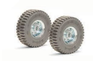
Set Drive wheels full rubber, non-marking Gray 2x Ø 250 x 80 mm Item number 335572