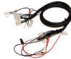
Cable harness complete Item number M1127-M050