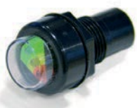
LED battery indicator (build-in) Item number M0318