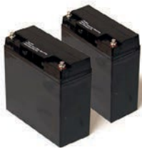
Battery AGM-VRLA (set) 24V / 22Ah Item number M0076-SP