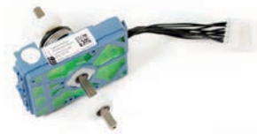
Switch tiller head excl. buttons Item number M0121-FLIPPER