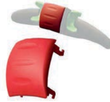
Belly button RED Item number M0121-BBUT