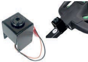
Horn 90dB Item number OPT0057