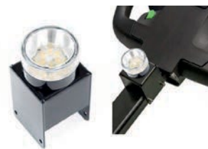
Strobe light (while driving) Item number OPT0065