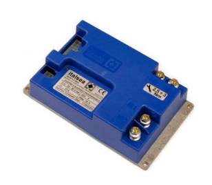
Item no. M1122 Drive controller Italsea 7CH4Q45C