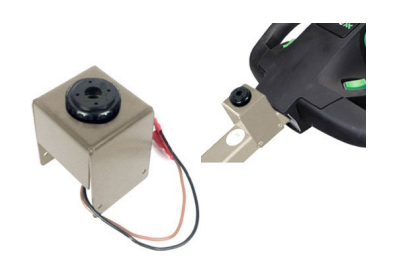
Item no. OPT0414 Horn 90dB (stainless steel)