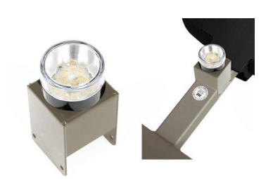
Item no. OPT0415 Strobelight tiller head support (stainless steel)