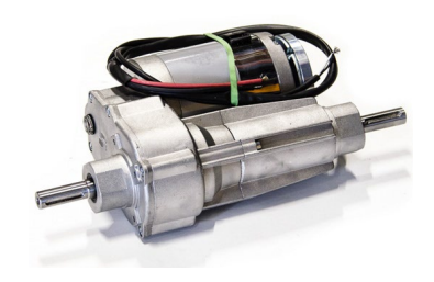
Item no. M1033 Engine 300W / 100 rpm, with brake