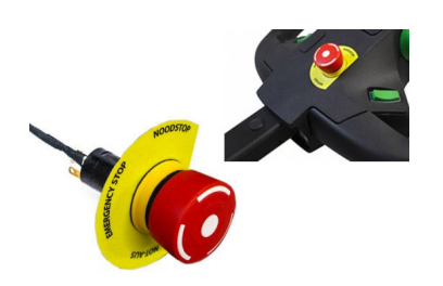
Item no. OPT0063 Emergency stop