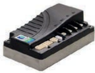
Curtis drive controller DC 24V, Inom 30A, Imax 50A Item number M3161