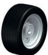
Drive wheel, full rubber Black Ø 180 x 80mm Item number M1075