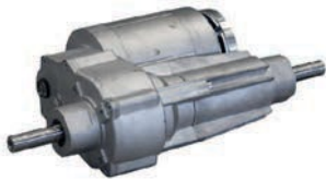
Motor 600W / 95rpm (brushless) with brake Item number M3164