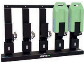
Charging station Lithium (5x), incl. Lithium charger 25,6V / 10A Item number OPT0029