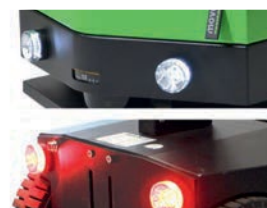
Light vision module Two front white LED's; two rear red LED's Item no. OPTAGV0009