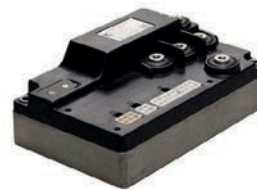
Curtis drive controller (brushless) DC 24V, Inom 50A, I max 130A Item number M3163