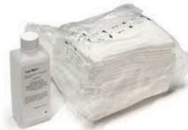
Safety scanner cleaning set Item number M0978-6