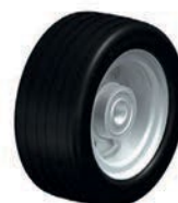
Drive wheel, full rubber Black Ø 180 x 80mm Item number M1075