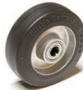
Wheel Ø 125 x 40mm Grey, electrical conductive Item number M2975