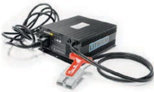
Charger (external) for Lithium battery, 25,6V / 10A Item number OPT0013