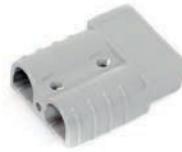
Battery connector SB50 Item number M0105