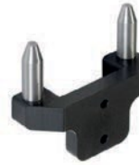
Battery guide Item number 339032