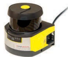
Safety scanner RSL420-S/CU416-5 with 10 individual switch- able field pairs. Maximal range 3m at 220° Item number M4061