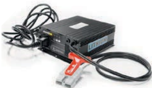
Charger (external) for Lithium battery, 25,6V / 10A Item number OPT0013